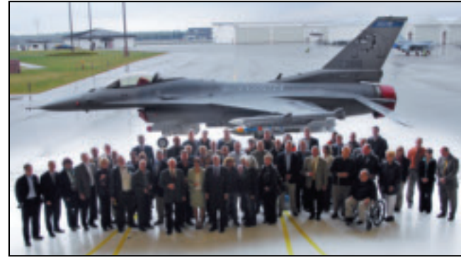
Distinguished guests of the 148th Fighter Wing pose in front of one of the wing's new F-16C Fighting Falcons at a wing celebration ceremony. Past and present members of the unit, friends and family, along with state and local officials gathered at the wing to celebrate the arrival of the new block 50 F-16C aircraft.

"Our previous airplane was like you bought a computer and just couldn't upgrade it anymore," said Bowman. "These new jets have almost limitless upgrade capability to the point where they'll be the second most capable we have in our inventory behind the F-22 until the F-35 comes online." Pilots and aircraft maintenance personnel are currently attending technical training for the new aircraft. All 20 of the new aircraft should be on base by the end of May. The conversion from the Block 25 to the new Block 50 aircraft will take approximately 18 to 24 months. "Today, we are at the top of all U.S. Air Force F-16 fighter wings," said Stokes. "It's a good day to be a Bulldog."