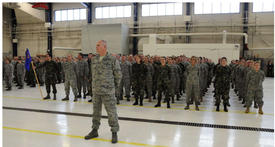
Members of the 148th Fighter Wing stand in formation during a change of command ceremony at the 148th Fighter Wing Mar. 22, 2009.