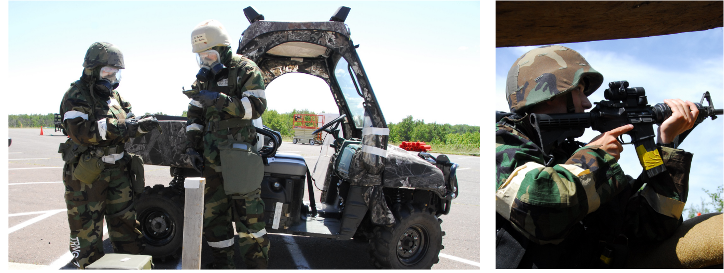
Check out the NEW 148th Fighter Wing website at www.148FW.ang.af.mil