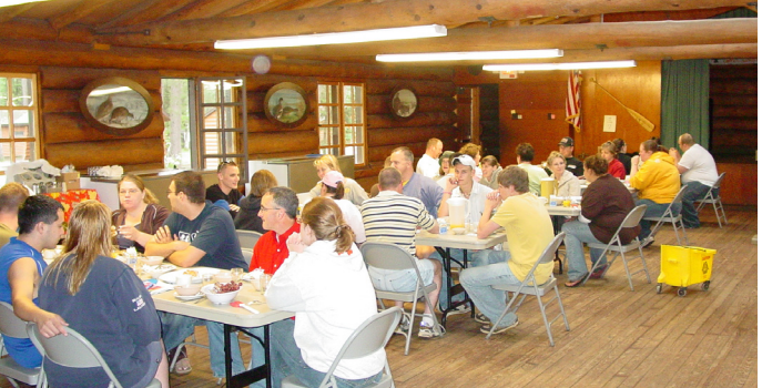
Couples enjoy one of the many delicious meals provided free of charge.

upon Camp Esquagama in Biwabik the last weekend of June. With sessions led by the 148th Chaplains and Assistants, the participants were given tools to help improve their communication skills to help their relationships grow stronger. During the weekend the couples also had the opportunity